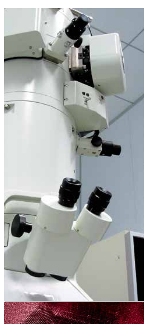
SUPPORTED IN PART BY: